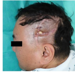
Figure 1. Preoperative clinical view. Preoperative lateral view of the right temporoparietal scalp demonstrating postoperative skin and soft tissue defect with wound breakdown following neurosurgical intervention.

Conclusions: A large posteriorly based local rotation flap can provide reliable coverage directly over exposed dura without calvarial reconstruction, especially in patients with prior MRSA infection, when meticulous debridement and infection control are ensured.