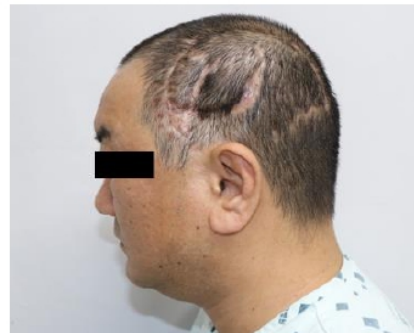
Figure 4. Postoperative clinical photo. Postoperative lateral view showing stable soft-tissue coverage of the right temporoparietal scalp following reconstruction with a local rotation flap after 1 month follow-up without any complications