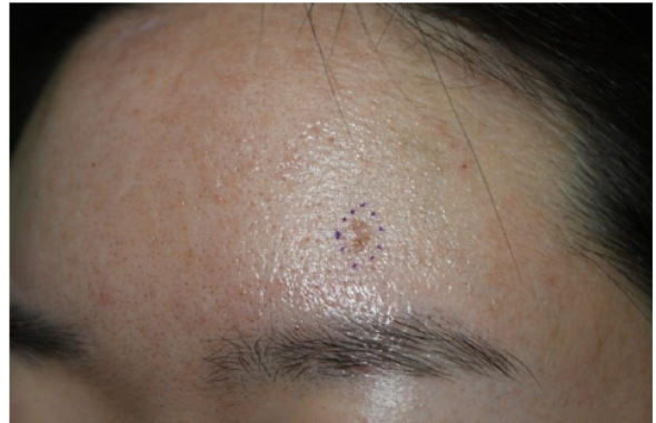
Fig 3. Preoperative gross photography of BCC (2nd BCC: left forehead)