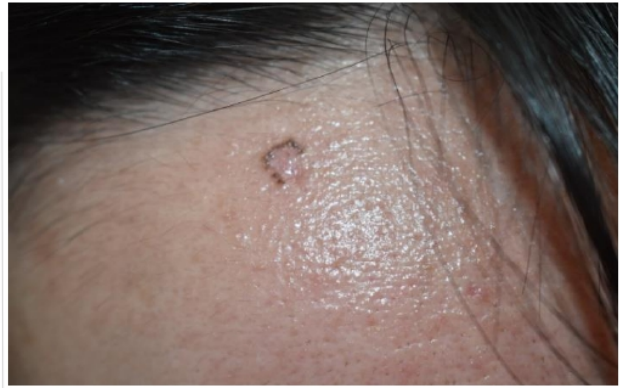
Fig 1. Preoperative gross photography of BCC (1st BCC: upper forehead)

Conclusion: NBCCS, or Gorlin-Goltz syndrome, is a systemic condition along with multiple or early onset BCCs. While noticing BCC through biopsy may be straightforward, it is essential to make a multidisciplinary approach to a patient with possible NBCCS. The presence of recurrent BCCs, coupled with palmar pits and the absence of the 12th rib emphasizes that diagnosing should not be limited to cutaneous lesions but should encompass various systemic conditions.