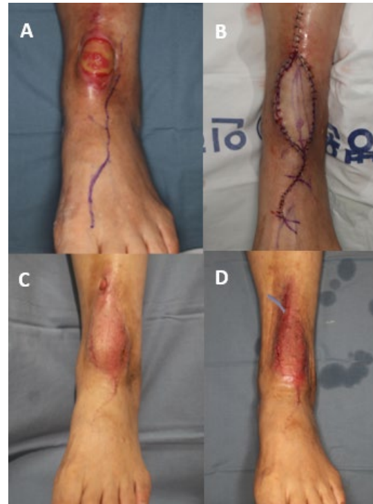
Fig. 1. (A) Tendon exposure (B) Coverage with lateral arm free flap (C) Postsoperative photograph, fistula formation (D) Closure with secondary closure

Conclusion: Chronic tendon and bone exposure is often associated with biofilm and subclinical infection, contributing to delayed healing. Free flap reconstruction provided stable coverage without major complications, though minor problems such as infection or partial flap loss were relatively frequent.