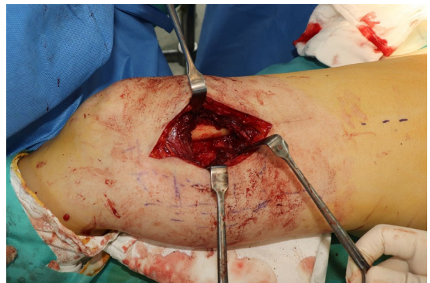
Fig. 3. Intraoperative photograph obtained after complete tumor resection, showing exposure of the distal femur following removal of the adherent mass.