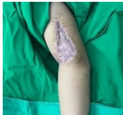
Fig 4. Post operative gross photography