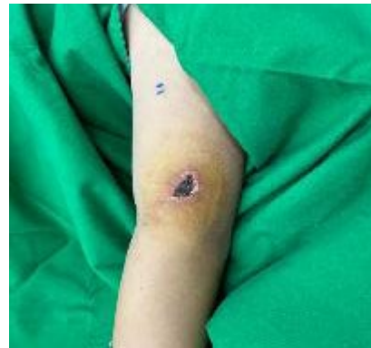
Fig 1. Preoperative gross photography

Conclusion: Monocled cobra envenomation may cause deep tissue and muscle necrosis requiring aggressive surgical management. Early debridement and appropriate reconstruction can result in favorable outcomes, highlighting the need for vigilance in injuries related to exotic pet ownership.