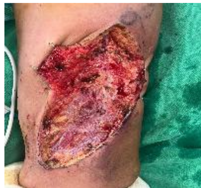
Fig 3. Intraoperative gross photography